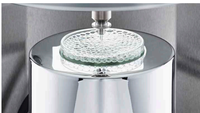
Sample stage with integrated temperature control

A thermostat jacket ensures the adjustment of the measuring temperature in order to simulate thermal process conditions. Optional disposable capillaries save cleaning time and simplify the investigation of contaminating or solidifying liquids such as inks or varnishes.