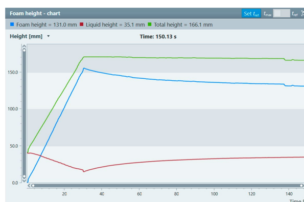
Simultaneous detection of total, foam, and liquid height