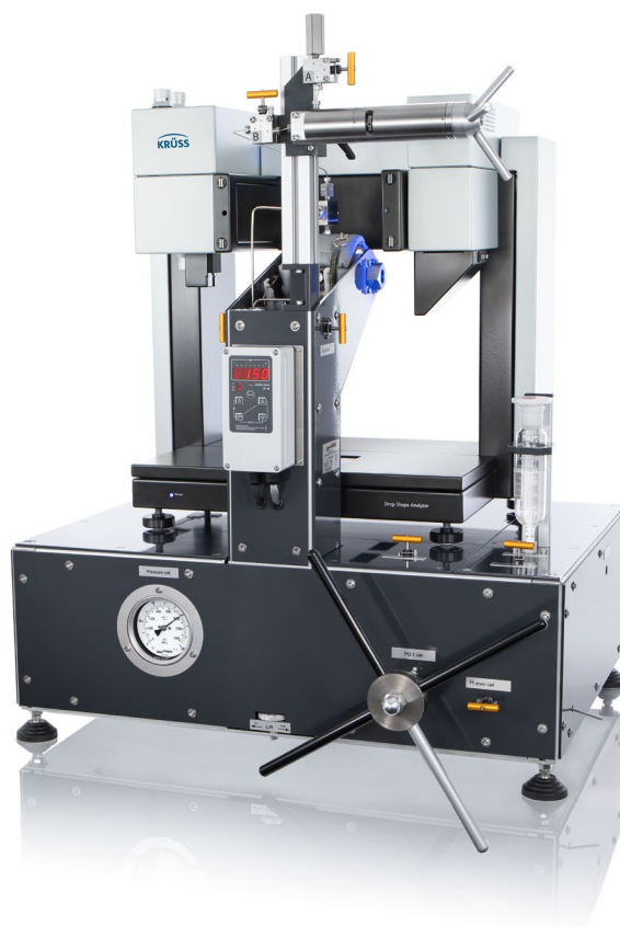
Drop Shape Analyzer – DSA100HP (DSA100HP690 configuration)