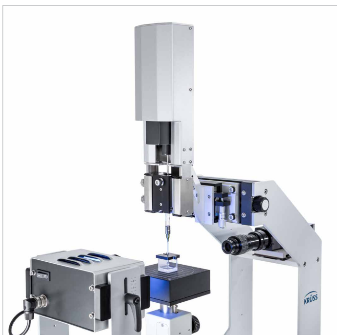
Oscillating Drop Module – ODM of the DSA30R

The dosing unit's extremely precise piezo drive enables exact sine waves in a frequency spectrum of 0.001 to 20 Hz, so the measurements cover a very wide dynamic range.